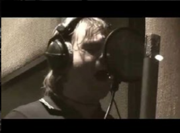
BE TRUE TO YOURSELF