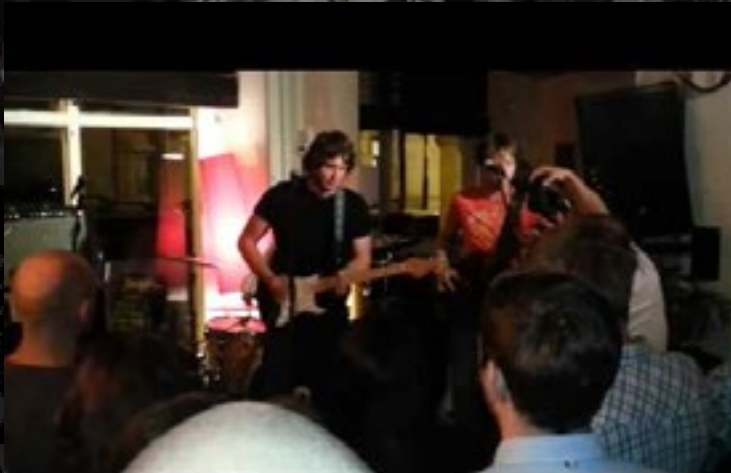
I'M OUT FOR THE SUMMER (live)